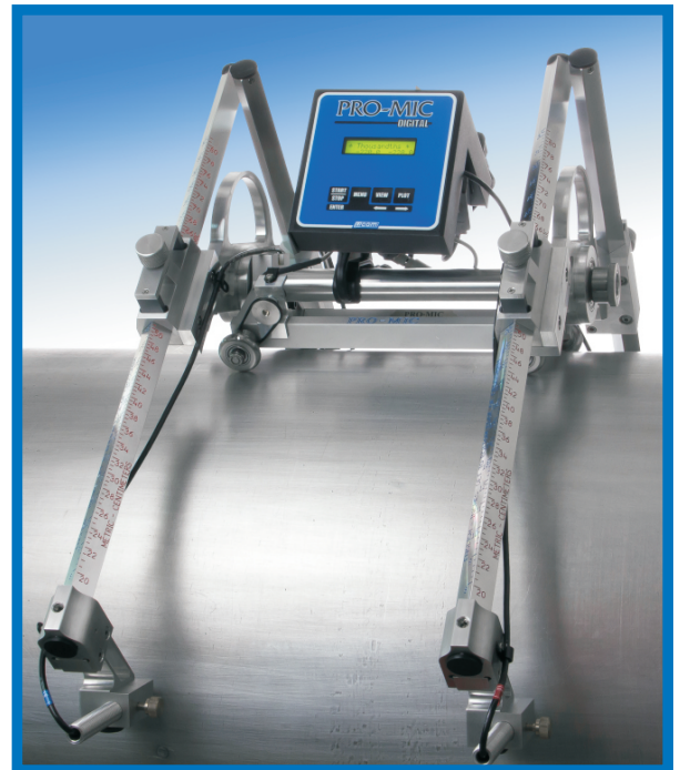
8" to 32" PRO-MIC TRUE End-to-End X-Caliper Design

Call us, or call any one of the more than 750 satisfied PRO-MIC users. Any of us would be happy to talk with you about our Systems.