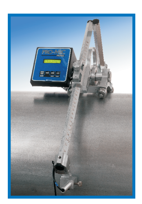
8" to 32" PRO-MIC Lightweight Weight: 9 lbs. 4" Wheelbase

Call us, or call any one of the more than 950 satisfied PRO-MIC users. Any of us would be happy to talk with you about our Systems.